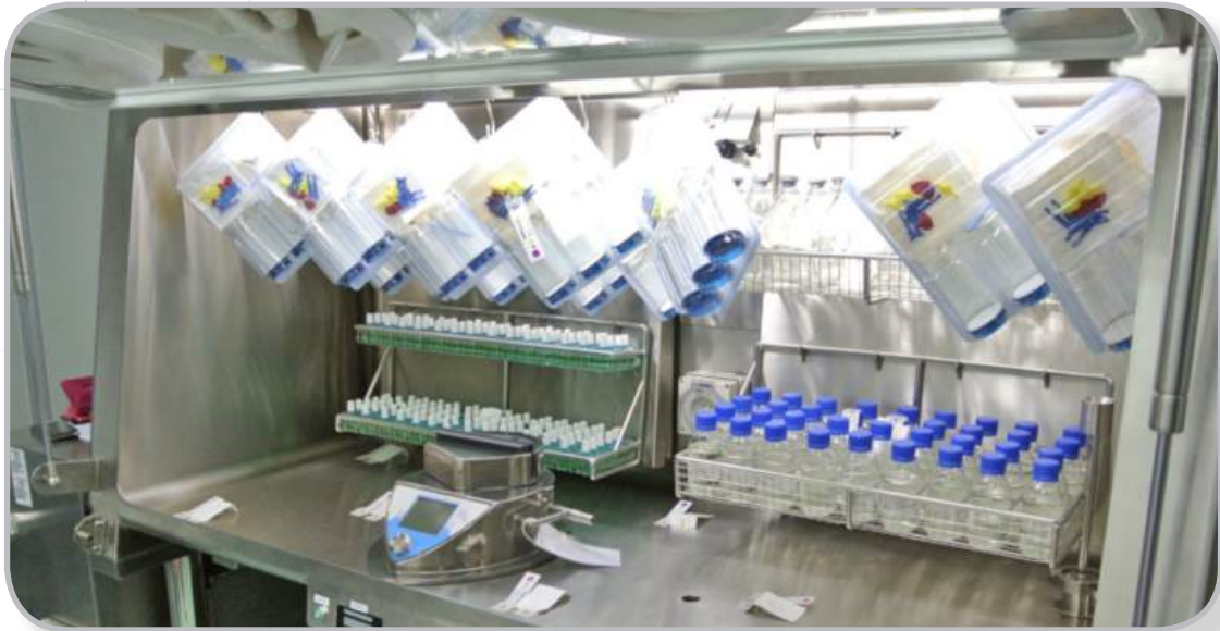
Customized interchangeable racking for sterility test batches